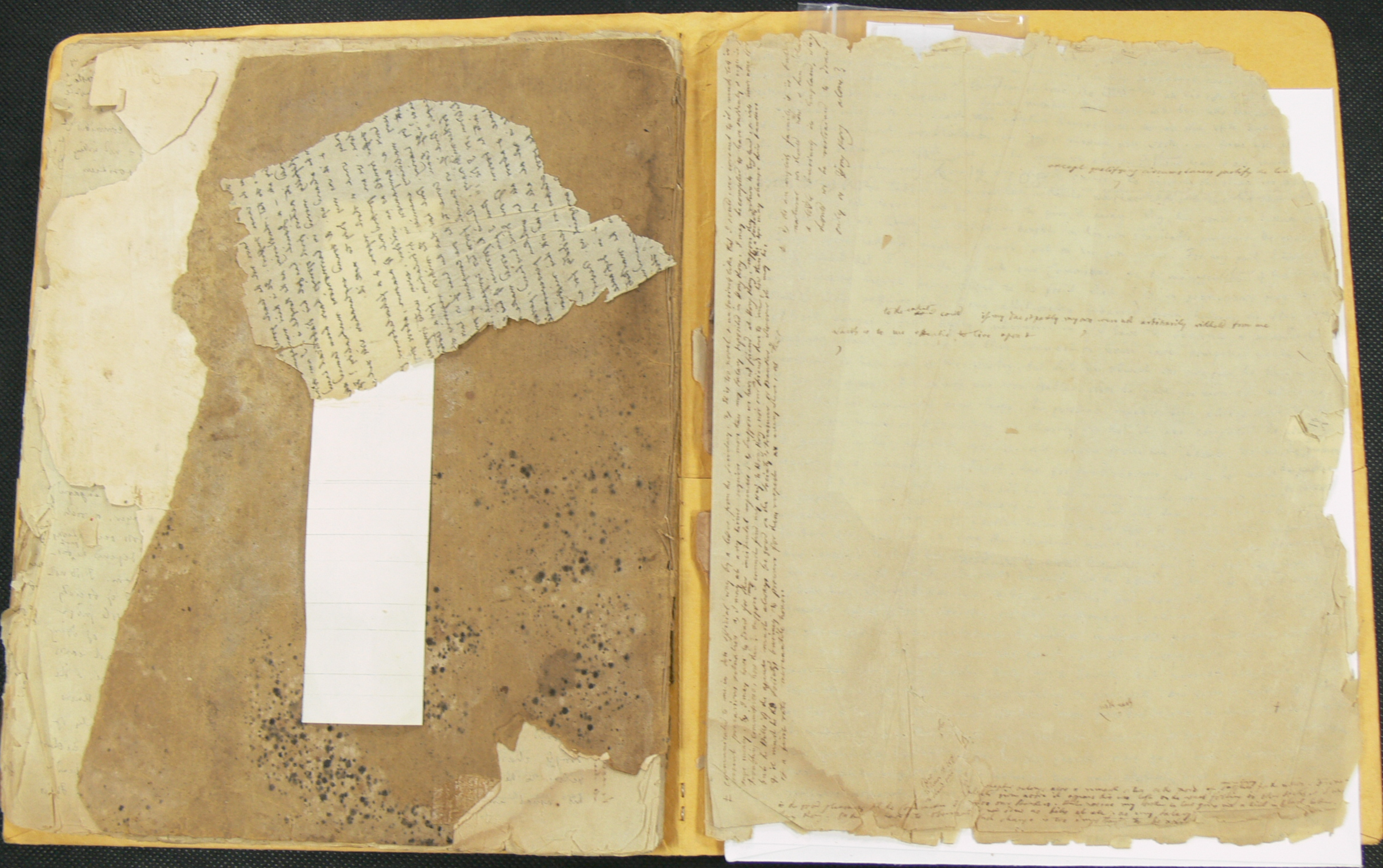
琉球大学附属図書館 (NO. 06-1) ベッテルハイム日記 NO. 2