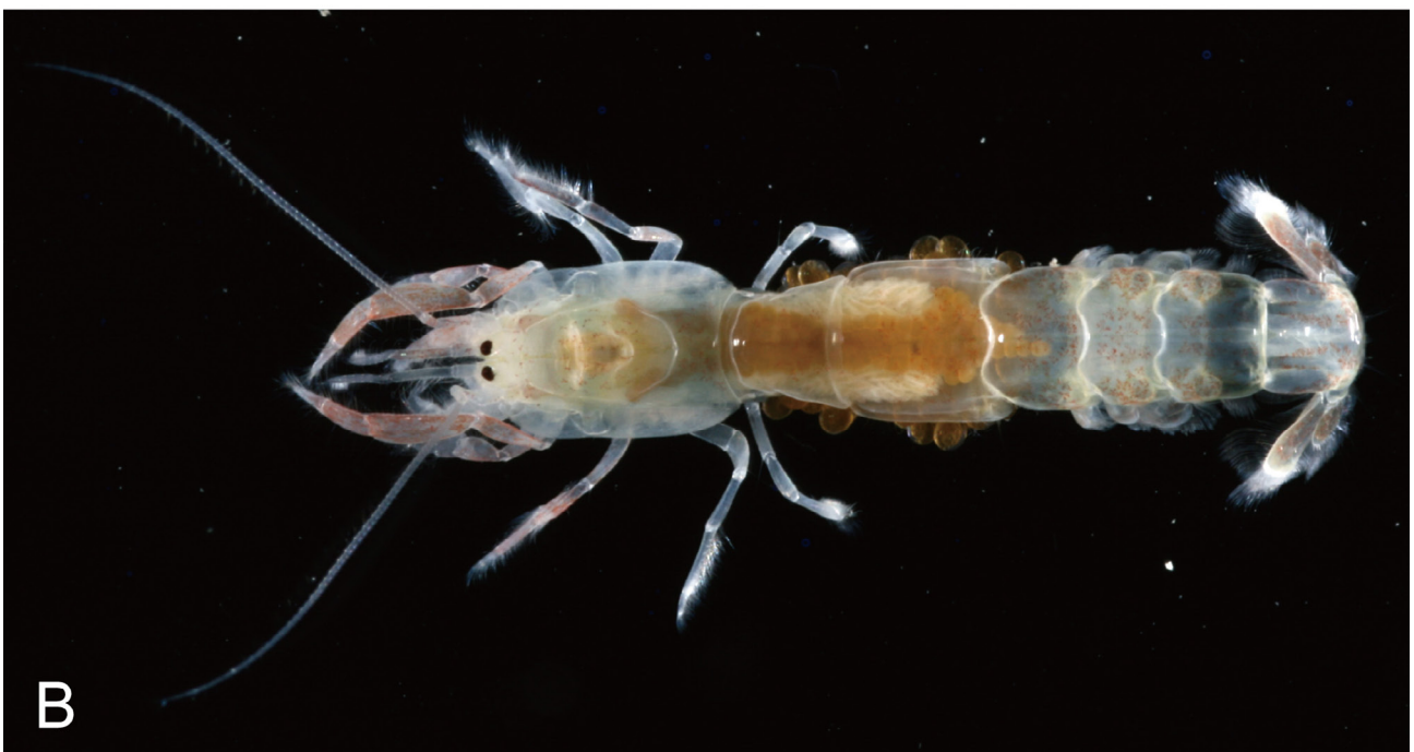
Fig. 3. Paratrypaea maldivensis (Borradaile, 1904), entire animals in dorsal view. A, male (cl 3.3 mm), RUMF-ZC-2609 (major right cheliped detached; palm damaged); B, ovigerous female (cl 3.4 mm), same lot.

図 3. Paratrypaea maldivensis (Borradaile, 1904) (新称: チゴスナモグリ), 全体背面. A, 雄 (頭胸甲長 3.3 mm), RUMF-ZC-2609 (大鉗脚は外れ, 掌部が破損); B, 抱卵雌 (頭胸甲長 3.4 mm), 同ロット.