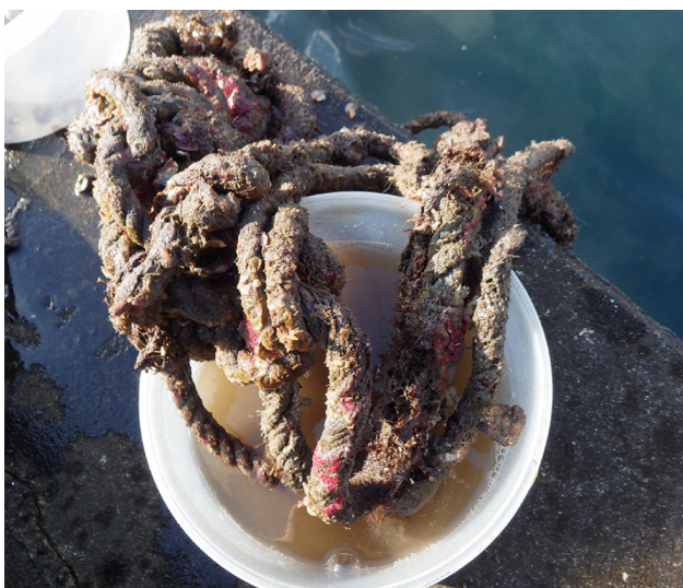
Fig. 1. An old, fouled tether line from Kurio fishing harbor, Yakushima Island, Ryukyu Islands, southern Japan, where the specimen studied was collected.

Sampling of tanaidaceans was conducted at the Kurio fishing harbor, Yakushima Island, Japan (30°16'08.0"N 130°25'09.7"E), on 18 December 2015 and 1 July 2016. The tanaidacean specimen was collected on one of the old tether lines investigated by the first author in 2015 (Fig. 1). The tether lines hung down from harbor walls, with most of each line continually submerged and encrusted by various sessile organisms, including ascidians, bryozoans, and hydroids. The fouled parts of the lines were rinsed in seawater to detach epibionts, and the water was sieved through a 0.3 mm-mesh plankton net. The tanaidacean was picked from the debris with forceps, and fixed and preserved in 99% ethanol. Total DNA was extracted from cephalothorax muscle tissue by using the silica method (Boom et al. 1990). Part of the cytochrome c oxidase subunit I (COI) gene was amplified by PCR with the primers LCO-1490 and HCO-2198 (Folmer et al. 1994). Methods for PCR amplification, sequencing, and sequence assembly were as described by Tomioka et al. (2016). The COI sequence obtained was deposited in the International Nucleotide Sequence Database (INSD) under accession number LC411960. The methods used for dissection, preparation of slides,