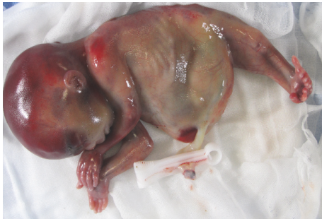
FIGURE 2: Sirenómelia with fused lower limbs and a bulging abdomen.

a termination of pregnancy. A fetus weighing 226 g was delivered vaginally at 19 weeks of gestation. The fetus showed fused lower limbs, a bulging abdomen, and absent external genitalia (Figure 2). Two femurs, two tibias, and absent fibulae were found on inspection and palpation of the fused lower limbs, so we arrived at a diagnosis of type III sirenómelia on the Stocker and Heifetz classification [4].