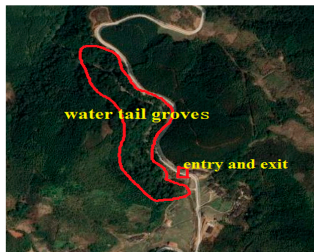
Figure A4. Geographical features of Gaoshan Village.