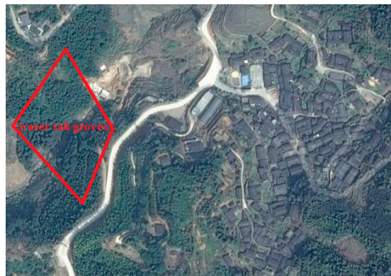
Figure 2. Water tail forests in Guifeng Village.

There are three types of water tail fengshui forests. The first type is a simple fengshui conglomeration. Here, the water tail (Figure 2) is located near a village’s entrance and exit to protect it from evil qi. As Table 1 shows, six of the seven surveyed villages have water tail forests.