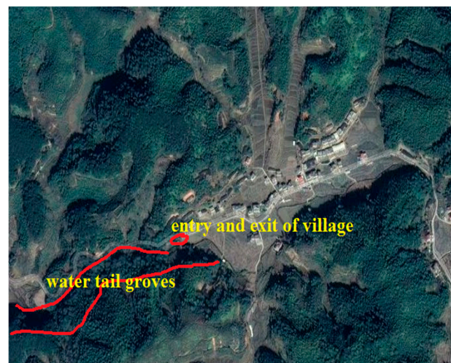
Figure A3. Geographical features of Dongshang Village.