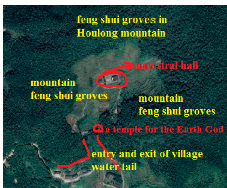
Figure A1. Geographical features of Lingtou village. Note: village houses surround the ancestral hall in ancient times. Vacant land in the figure is farmland.