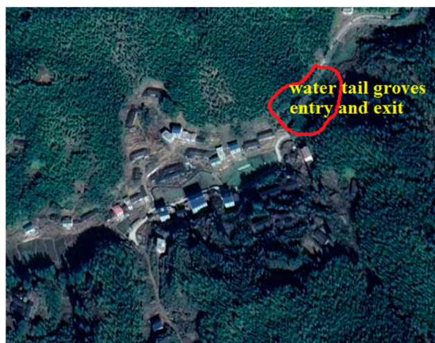
Figure A5. Geographical features of Kengtou Village.