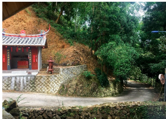
Figure 5. Temple of the earth god in Kengtou Village.

The forms of fengshui forests mentioned above reflect the psychological, spiritual, and community needs of villagers. The integration of culture and ecological thoughts here means that, in some places, villages have developed their own distinctive style of fengshui forests.