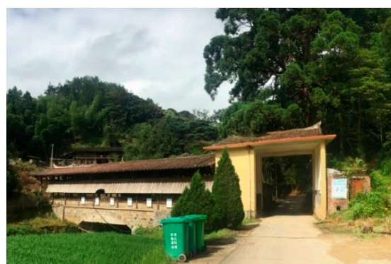
Figure 3. Corridor bridge in Dongshang Village.

The second type of water tail fengshui forest combines fengshui forests, a corridor bridge, and/or a temple. The Hakka people deeply believe in that water must flow into and out of a village through a broad, heavenly entrance and a narrow earthen exit. In Dongshang Village, for example (Figure 3), where the Hakka culture is blended with the local culture of Youxi County, a fengshui forest and corridor bridge at the water tail creates a narrow earth exit, thus metaphorically preventing money from leaving the village too quickly. There is a canal on the far side of the bridge so that people can see the stream’s flow—this is the broad, heavenly entrance which symbolises the inflow of fortune from all directions.