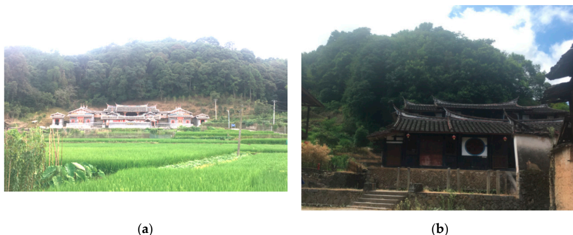
Figure 6. Fengshui forests around ancestral halls in (a) Zhongxian Village on the left and (b) Guifeng Village on the right.

golden egg—a symbol of fertility and wealth (Figure 6a). Likewise, villagers in Lingtou Village see the environment surrounding their ancestral hall as a swan hatching eggs—a symbol of their descendants' fertility (Figure 6b).