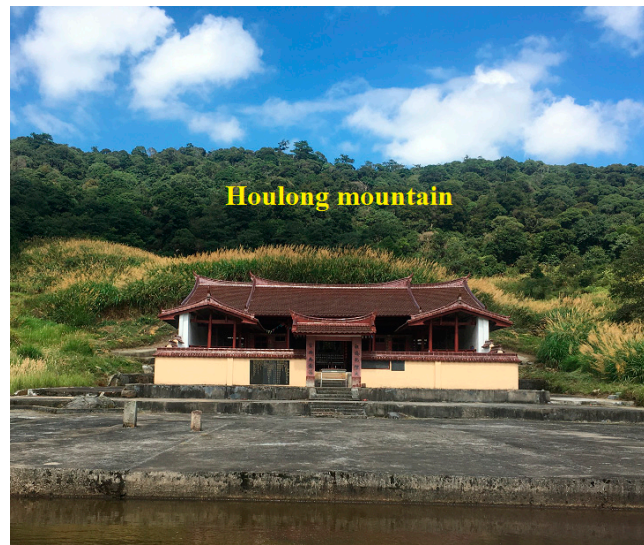
Figure A2. Fengshui forests around the ancestral hall of Lingtou Village.