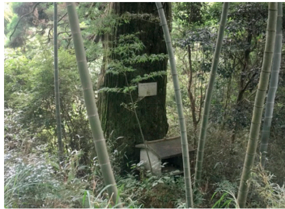
Figure 4. Open-air memorial tablet in Lingtou Village.

temple for their earth god there. Figure 5 shows a more conventional site of worship—a temple in Kengtou Village, which was built next to a fengshui forest.