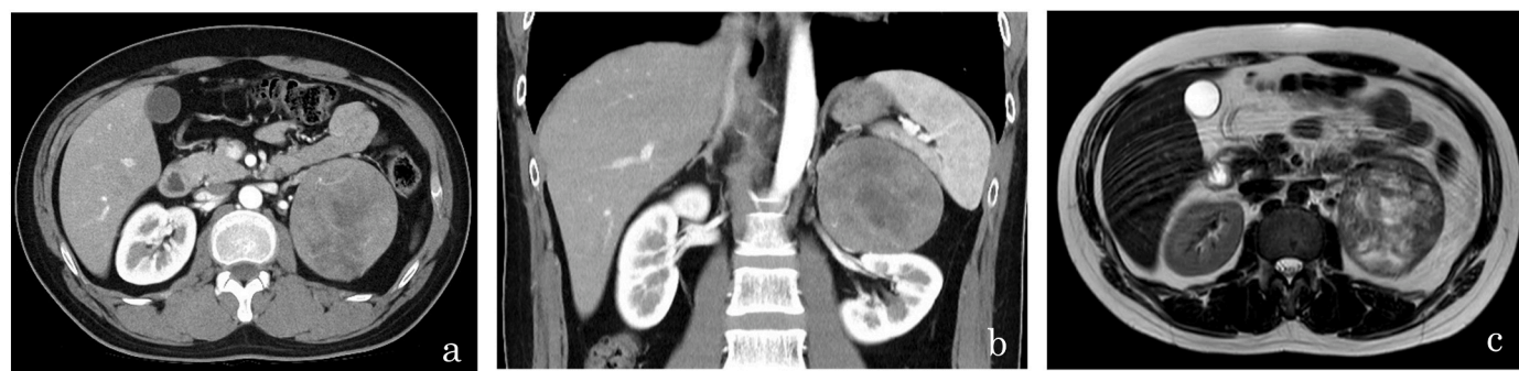
Fig. 1. Radiologic findings. (a, b) Contrast-enhanced computed tomography revealing an 8.6 × 7.7-cm heterogeneously enhancing left suprarenal mass with increased vascularity. (c) T2-weighted magnetic resonance imaging showing a hyperintense left adrenal mass.