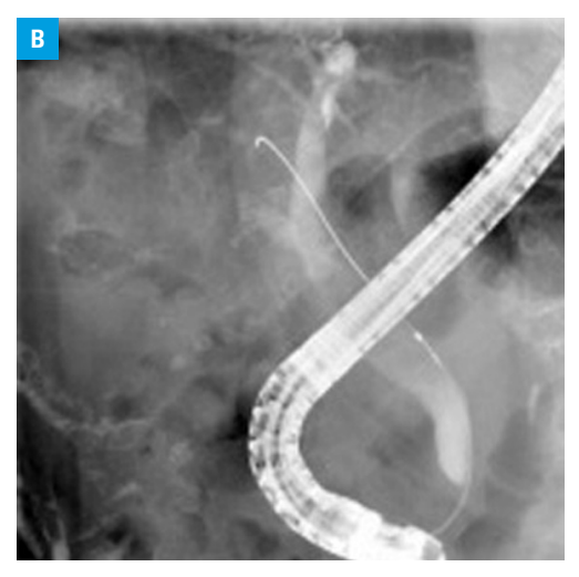
FIGURE 1 Endoscopic retrograde cholangiopancreatography imaging: A – a large juxtapapillary diverticulum; B – absence of gallstones or tumor in the common bile duct